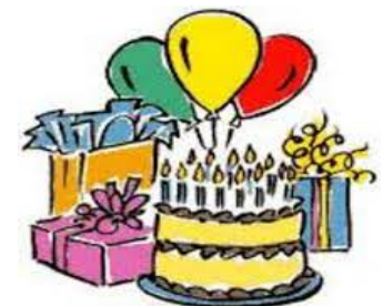
OUR PASTOR'S BIRTHDAY